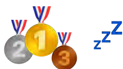
Tableau des médailles

Sur chaque page cliquez sur l'affiche pour revenir aux pages de garde